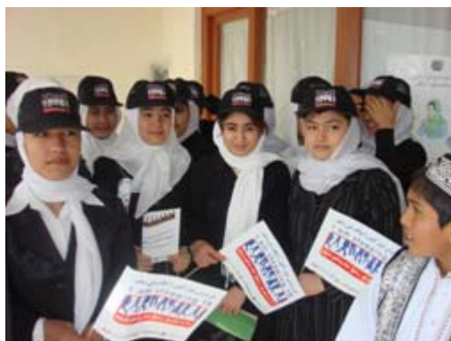
Other World TB celebrations in Afghanistan

For more information about Zambia's World TB Day activities, please see the attached report.